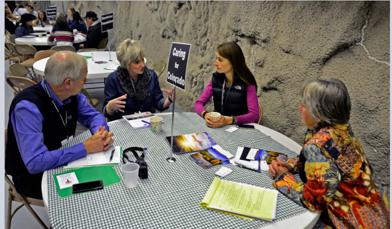
Funders and nonprofit staff have face-to-face conversations and learn ways to partner.

In 1991, Sue Anschutz-Rodgers learned that only 3% of Colorado's philanthropic dollars were being allocated to rural nonprofits across the state. For 27 years, the Anschutz Family Foundation has partnered with the Community Resource Center to bring donors and rural nonprofits face-to-face. The three-day conference also includes trainings and networking opportunities. As of 2017, more than 20% of Colorado's philanthropic dollars are helping rural communities.